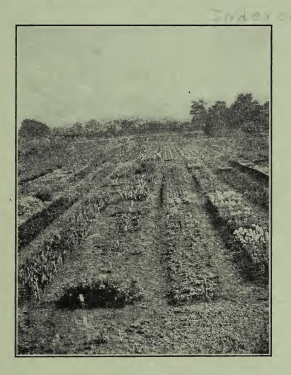
NURSERYMEN Agawam, Massachusetts